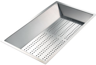
Stainless steel perforated tray 8151 000 * only in combination with the accessory 8100 627