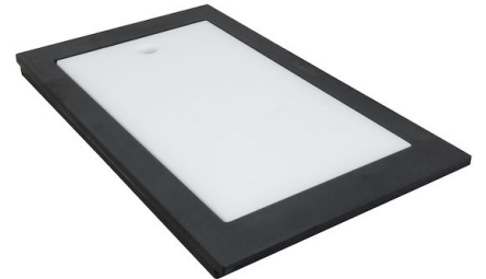
HDPE + Black Twin chopping board 8100 627