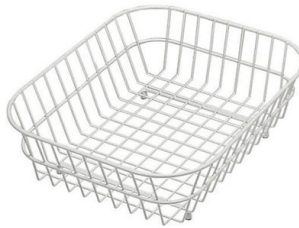
White basket 8612 100