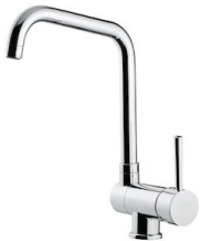
Mixer Tap Drop 8523 000